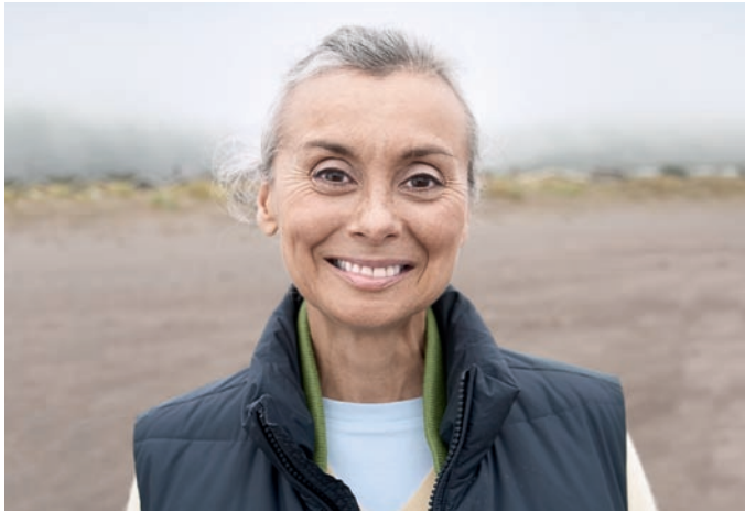
Strong, healthy teeth are important for health and well-being.

Unsecured dentures are an old-fashioned solution for people who have lost all of their teeth. Unfortunately, you may find that wearing unsecured dentures can be painful, inconvenient and awkward. Such dentures make it difficult to chew a variety of foods, which can stop you from eating many of the foods you once enjoyed. Wearing dentures may also affect how you pronounce words, and therefore the way you speak.